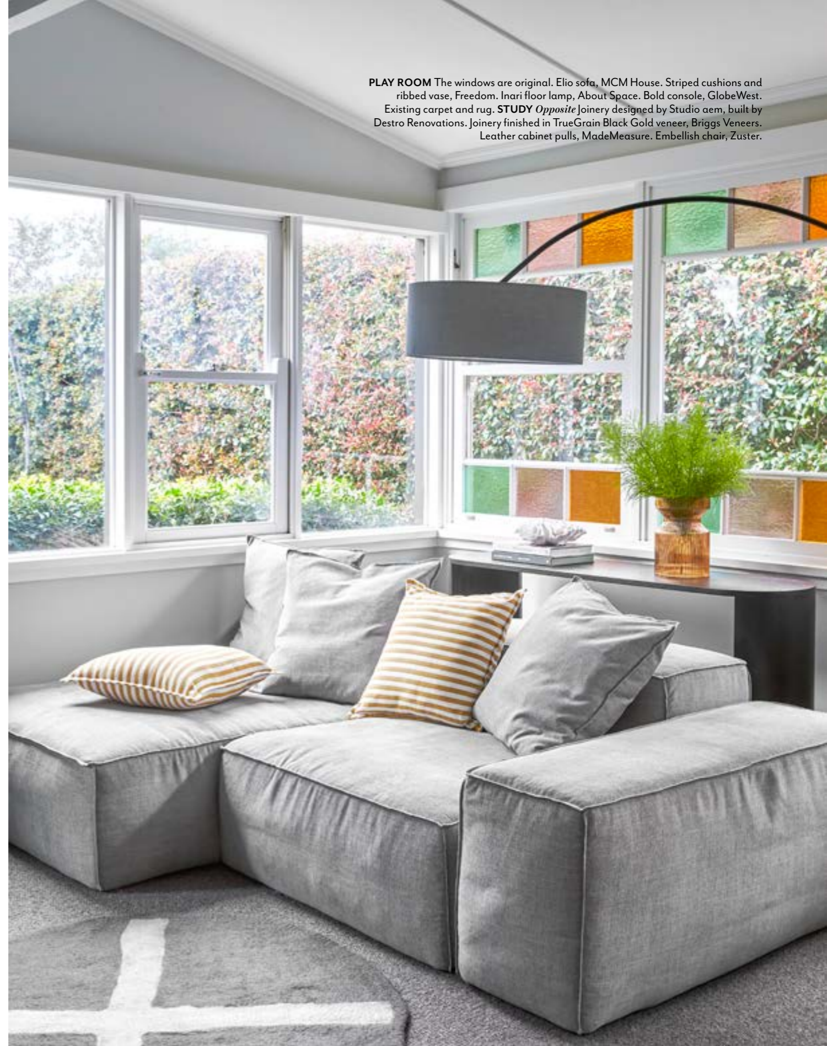
PLAY ROOM The windows are original. Elio sofa, MCM House. Striped cushions and ribbed vase, Freedom. Inari floor lamp, About Space. Bold console, GlobeWest. Existing carpet and rug. STUDY Opposite Joinery designed by Studio aem, built by Destro Renovations. Joinery finished in TrueGrain Black Gold veneer, Briggs Veneers. Leather cabinet pulls, MadeMeasure. Embellish chair, Zuster.