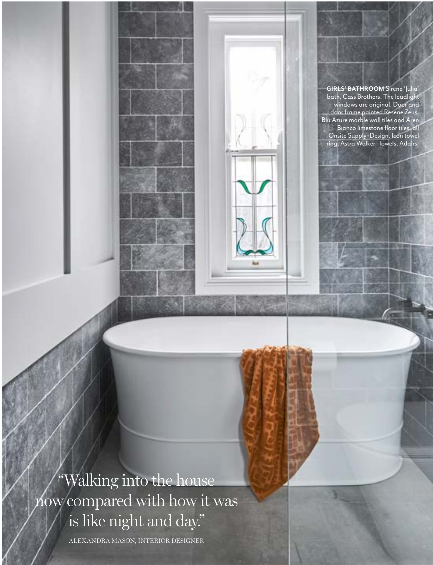
GIRLS' BATHROOM Sirene 'Julia' bath, Cass Brothers. The leadlight windows are original. Door and door frame painted Resene Zeus. Blu Azure marble wall tiles and Aren Bianco limestone floor tiles, all Onsite Supply+Design. Icon towel ring, Astra Walker. Towels, Adairs.

“Walking into the house now compared with how it was is like night and day.”